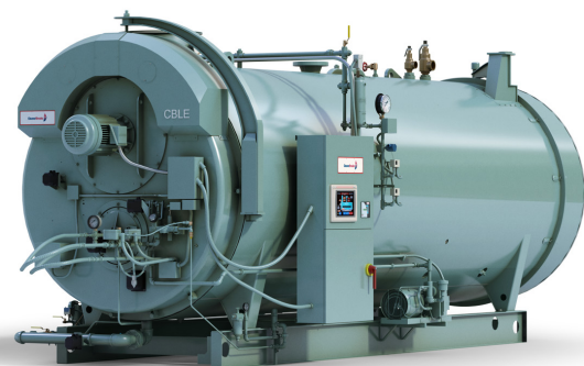
STEAM & HOT WATER BOILERS