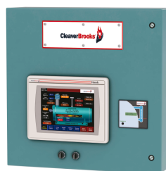
HAWK CONTROLS W/ VSD